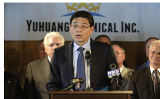
SHANDONG YUHUANG CHEMICAL Represents the first investment from mainland China in Louisiana's history