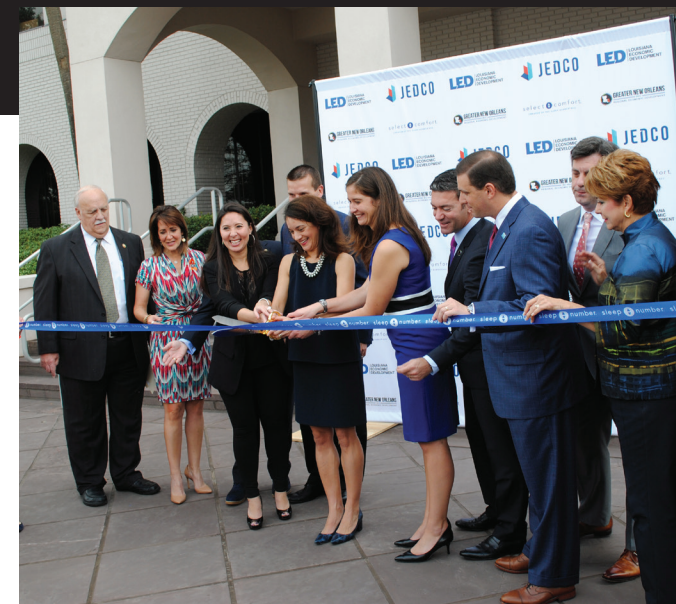
SELECT COMFORT Select Comfort Corporation, a $1.3 billion publicly-traded company, opened a 225+ employee Relationship Center in Elmwood. The center provide sales and support services for customers of the company's Sleep Number® beds and accessory products.

Lucid Search Influence Major League Gaming Second Line Studios Momentive Select Comfort Monsanto Select Laboratories Mosaic Shandong Yuhuang Chemical Nalco Shiptech Services NASA Michoud Sinter Metal Nest Smashing Boxes Netchex Smoothie King N.O. Cold Storage Starr Textiles N.O. Hornets TCI Plastics Nims Center Tech Talent South Noranda Torsh Nucor Total Quality Logistics Pelican Energy Triton Stone Group Performance Software TriWest Healthcare Alliance Pin Oak Holdings Valmiki Capital Provision Healthcare Venture Global LNG Quixote Studios Radolo Rain CII Reily Foods Co. Revolution Foods