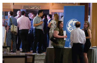
GE DIGITAL This 300+ employee technology center services several verticals of General Electric

Accruent DXC Technology Agrico Sales Dyno Nobel Air Products & Chemicals Elmer's Chocolate AlquemyIQ Factory VFX Apptitude Fogo Data Centers Atlantic Metrocast Folgers Ballista Formosa Petrochemical Bayou FX GE Digital Blade Dynamics Globalstar Boeing High Voltage Software Bradken Industries Horizon Entertainment British Airways iMerit Cajo Innerfuse Collision inXile Entertainment Condor Airlines IT Minerals Copa Airlines LA Buyout Fund CPX Interactive LiquidX Denka Lockheed Martin